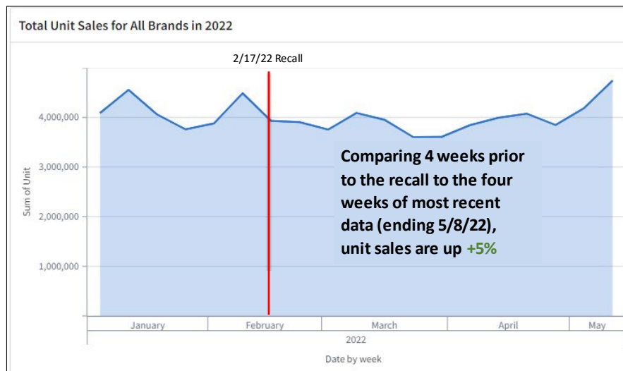
Figure 2: Total National Volume Sales Infant Formula 2022 Year-to-Date

*Food and Drug Administration custom Infant Formula definition, excluding Electrolytes. Based on IRI POS data, data ending 05/08/2022 as compared to 4 weeks ending 2/13/2022, Geography: Total US - Multi Outlet + Conv Measure: Unit Sales.