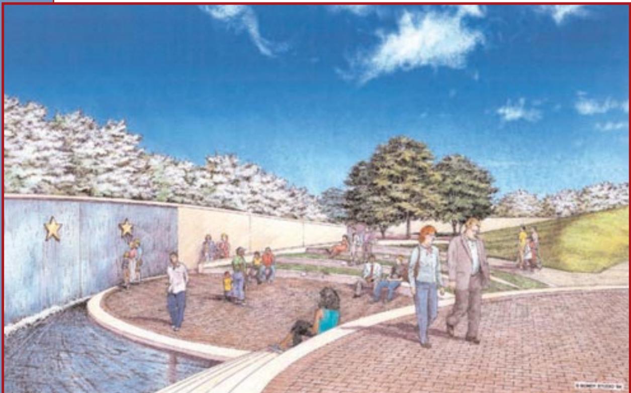
Gold Star Families Memorial and Park • “Central Gathering Plaza”