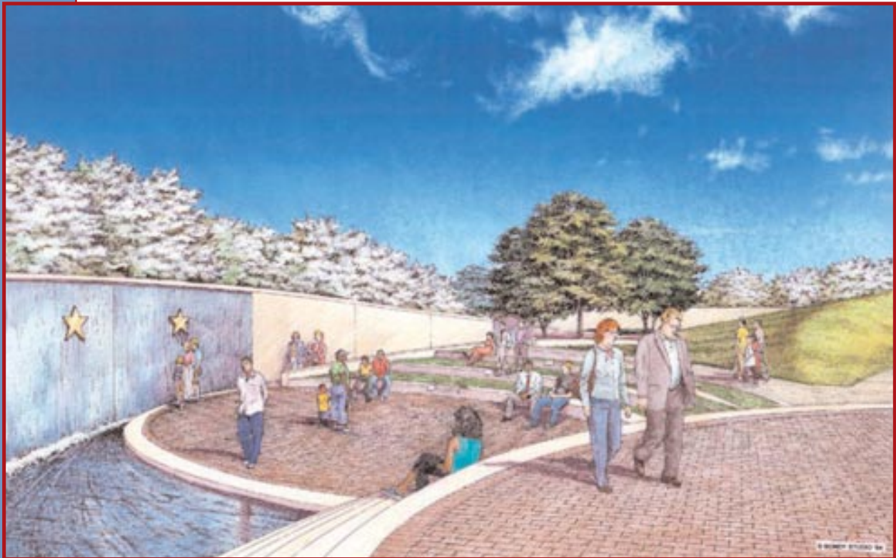
Gold Star Families Memorial and Park • “Central Gathering Plaza”