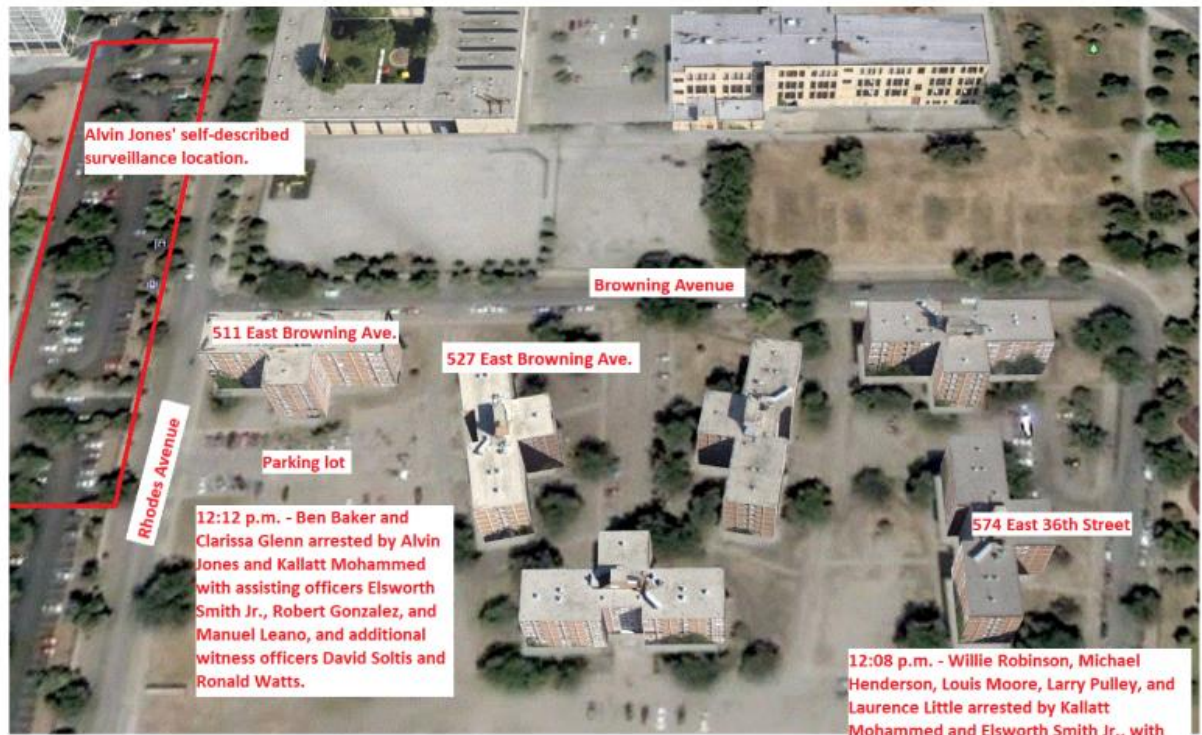
COPA Demonstrative exhibit #3 LOG #1087742